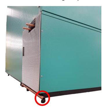
Figure 2-5 Chamber Drain Connection

Connect this drain to a building floor drain or drainage system.