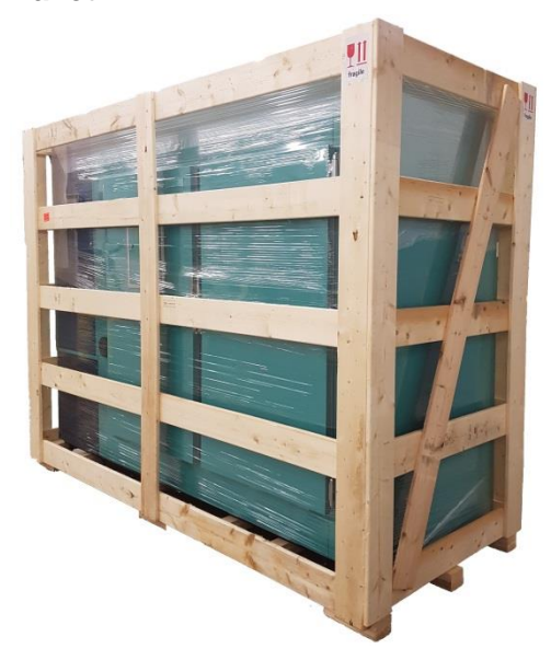
Figure 2-2 Shipping Crate