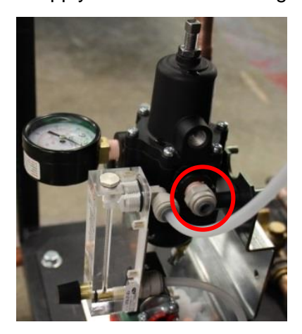
Figure 2-10 C0<sub>2</sub> Supply Line Connection

Install 1/4" OD tubing from the CO<sub>2</sub> supply to the inlet on the regulator.