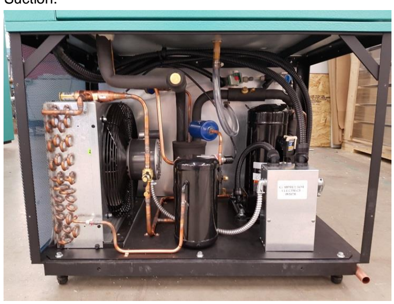
Figure 2-8 Air Cooled Condensing Unit