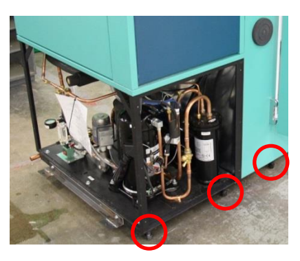
Figure 2-4 Chamber Levelers