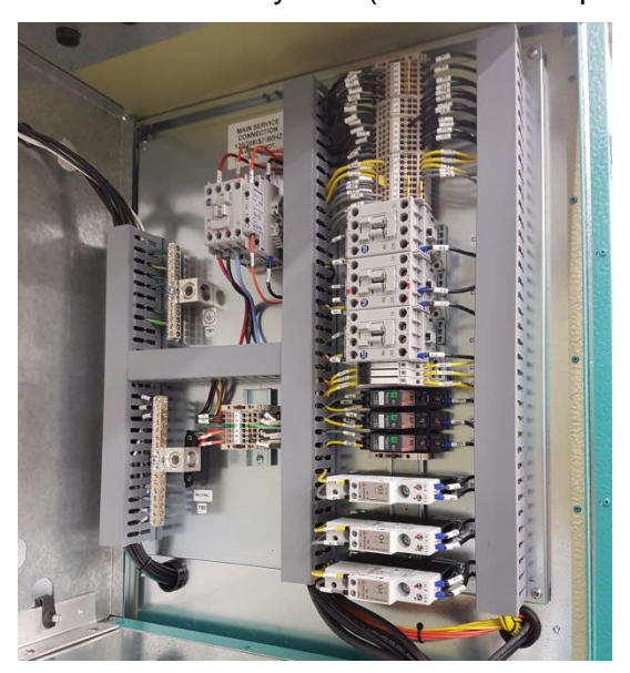
Figure 2-11 Electrical Service Line Connections