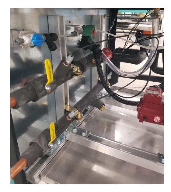
Figure 2-6 Water Cooled System Connections