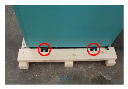
Figure 2-3 Shipping Lag Screws

1. Remove the four lag screws (Figure 2-3), two on each end, securing the shipping bracket to the pallet.