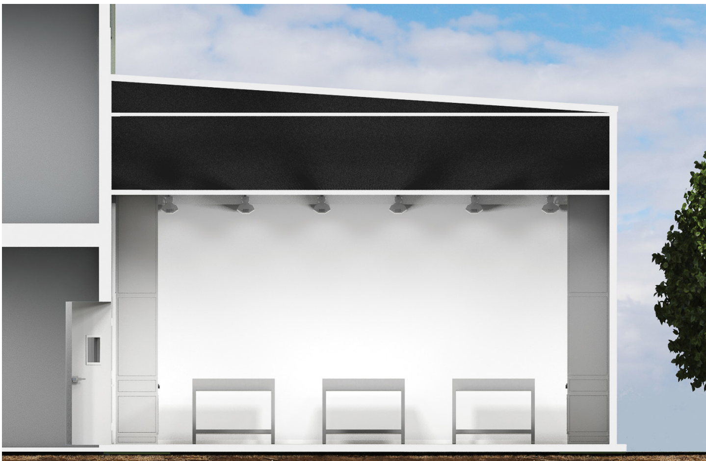
Cross section view