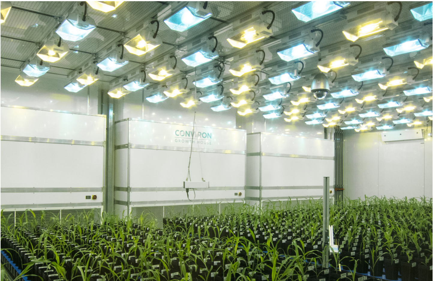
Overhead view of Conviron Growth House™ (ceiling not shown)

The Conviron Growth House™ offers a compelling alternative for scaling up research experiments compared to what has historically required a greenhouse or multiple controlled environment rooms. Installed indoors, the Conviron Growth House™ can make use of available space and integrate seamlessly into the research facility. Available in many size configurations, the Conviron Growth House™ ensures available space within your facility is fully utilized - maximizing your growth area.